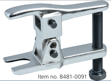
Item no. 8481-0091