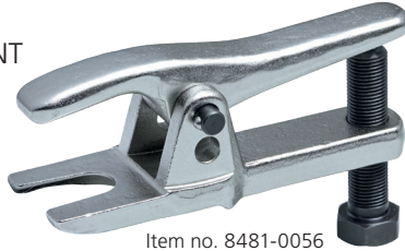
Item no. 8481-0056